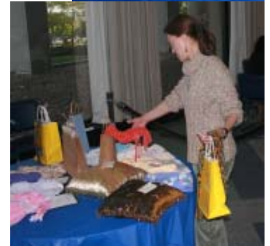
Shopping the Showcase!